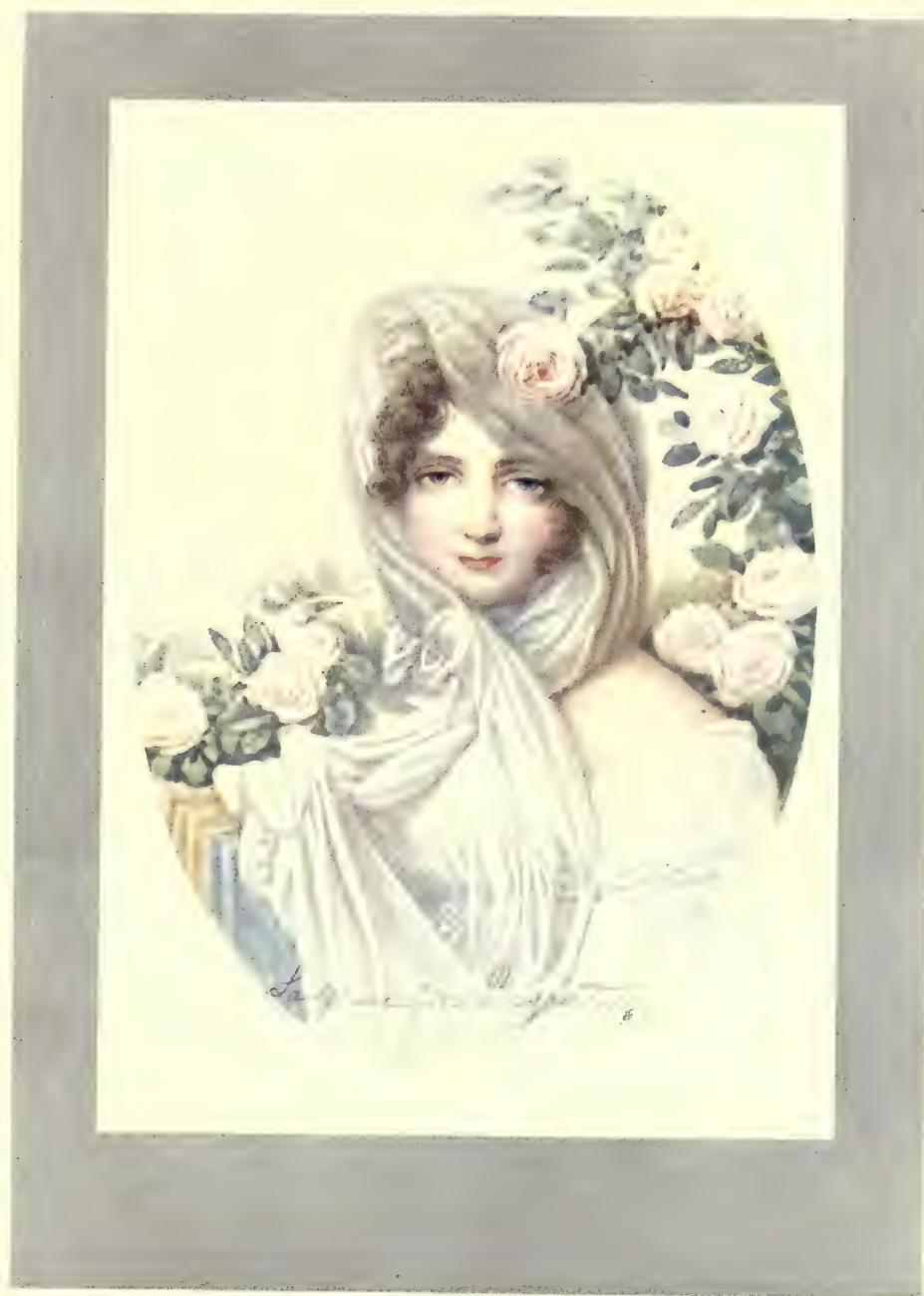
FÜRSTIN KATHARINA BAGRATION SKAWRONSKA BY JEAN BAPTISTE ISABEY (1812)